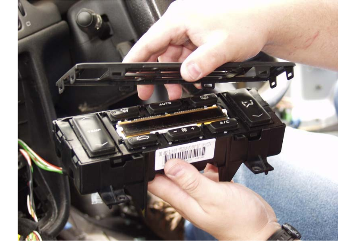
Removing the buttons from the Sterio fascia

1. Gently pull off the volume knob from the front of the fascia. Then, on the reverse side, unscrew the circled screws being carefull not to scratch the board in any way.