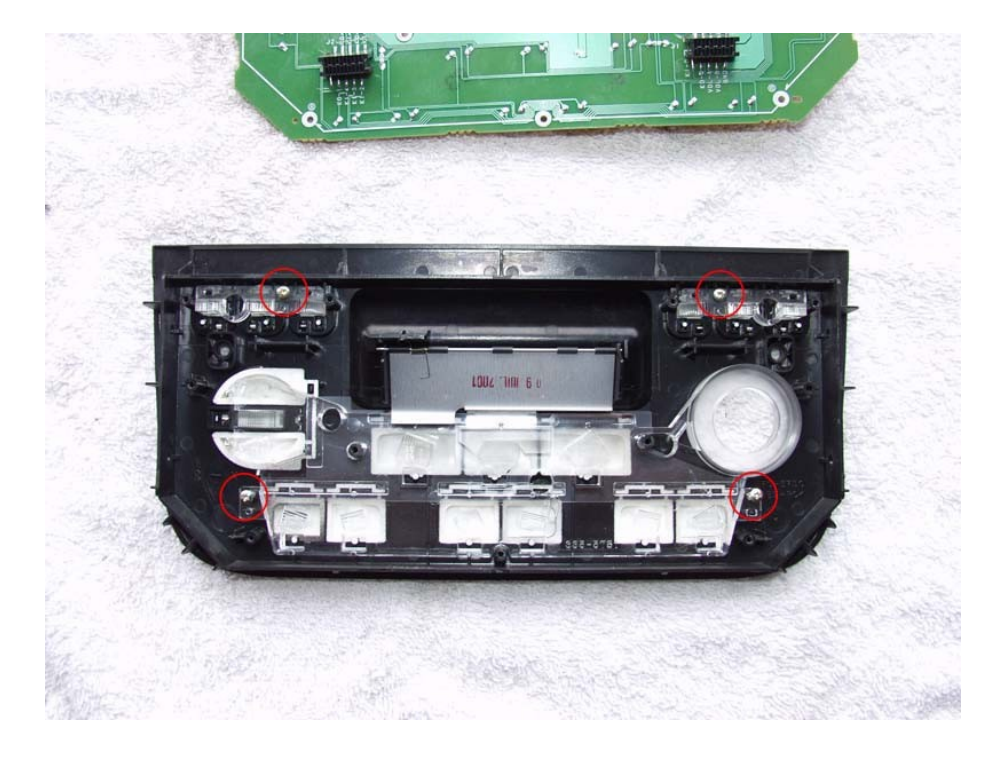
3. The bigger buttons pop off with ease.

2. Now unscrew the remaing screws, also circled here for reference. This releases the clear plastic light diffuser.